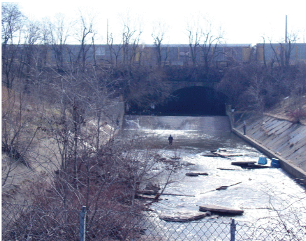
St. Clair Spillway