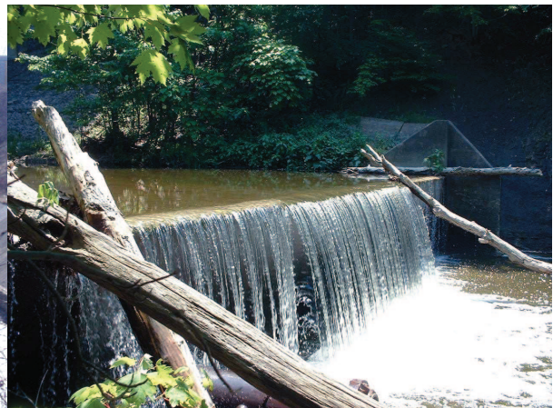
East Branch Metroparks Dam