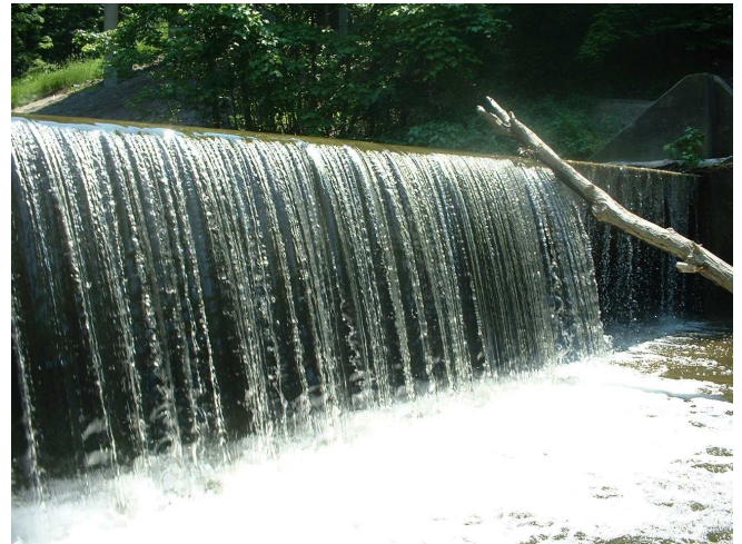
East Branch Dam

Funding is being pursued with various partners to find design solutions for these sites.