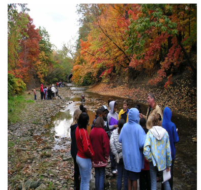
Euclid Creek near Euclid Central

The Project Team has been exploring the corridor to understand the challenges and opportunities for a greenway. The Project Team will be working with the Community Advisory Team on public input work sessions early this Spring, so stay tuned on those dates. Meanwhile, if you have thoughts, ideas or would like to be involved on the Community Advisory Team, please contact the Watershed Coordinator, your local community, or the Northeast Shores Development Corporation.