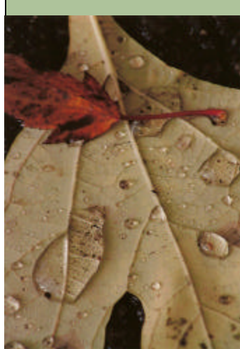
2004-2005 1st Place Winner

The FOEC membership continues to grow and is fast approaching 100 members!