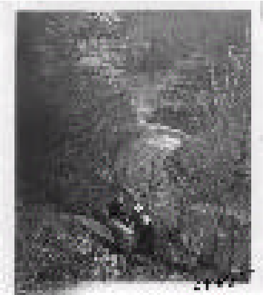
Euclid Creek, 1949