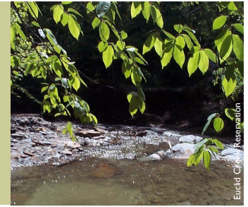
Euclid Creek Restoration