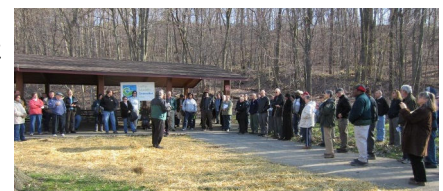
Over ninety people celebrate the 1st dam removal project in Euclid Creek at the Cleveland Metroparks Euclid Creek Reservation