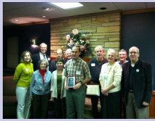
FOEC Officers and Award Winners

Great food, friends and music were to be had at the Friends of Euclid Creek's annual holiday party and fundraising event on December 6th. Several people were recognized for their outstanding work to preserve and enhance the watershed, including: