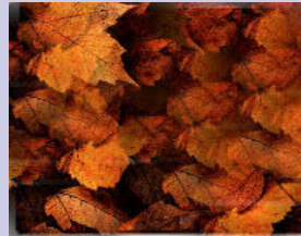
Brianna Motley's Autumn Leaves Best of Show photograph

25 talented photographers submitted 87 fantastic photos, and 23 photos were winners.