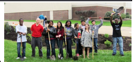
Mayfield and Richmond Heights Key Clubs help plant a rain garden at the County Airport Administration Building