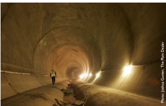
This 2007 photo shows the inside of the Mill Creek Tunnel, a massive underground sewage pipe that was the prototype for a series of seven more tunnels being planned by the Northeast Ohio Regional Sewer District. The Euclid Creek Tunnel is next to be built and will actually extend under Lake Erie for about half a mile along the shoreline.

Greater Cleveland's earliest sewers (primarily within the City and its inner-ring suburbs) are combined sewers . Built around the turn of the 19 th century, these sewers carry sewage, industrial waste and stormwater in a single pipe. During heavy rains, there is a dramatic increase of water flowing through the combined sewers. When this happens, control devices may allow some of the combined wastewater and stormwater to overflow into area waterways—such as Lake Erie and Euclid Creek—to prevent urban flooding. This event is called a combined sewer overflow (CSO), and harms our clean water environment.