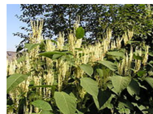
Flowers of the invasive Japanese knotweed, an aggressive plant inundating Wildwood State Park