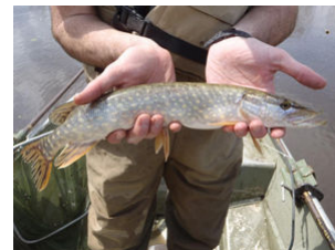
Northern Pike found in nearby Arcola Creek—we're hoping to see some in Euclid Creek once the project is complete!

-This project is funded through a US EPA administered Great Lakes Restoration Initiative grant.