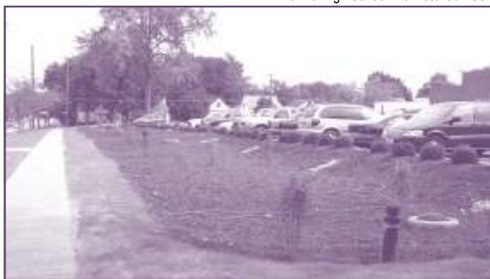
Parma High School Bio-Retention Cell

Effective community implementation will result in meaningful storm water quality management and more importantl, can improve the quality of life in Cuyahoga County.