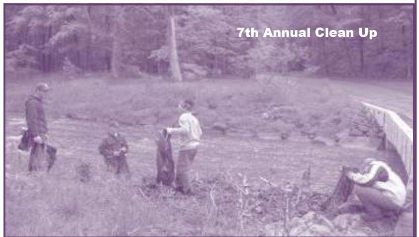
7th Annual Clean Up