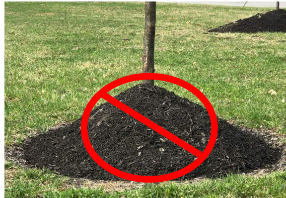
This volcano mulching madness has to stop. Just say no to volcano!

We need you to help identify locations where trees are planted incorrectly. When you are out and about and see issues such as volcano mulching or trees planted too low, make a note of the address (or cross streets), property information, and photos if you can. Go to our website, fill out a form and send in photos. We will contact the property owners to bring this issue to their attention with the intent of assisting them to correct the situation and not make these choices in the future.