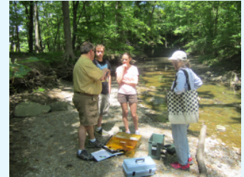
Volunteer Monitoring Training

We monitor five sites along Euclid Creek since 2006, and data helps us understand water quality trends and potential problems. We sample for water chemistry. Training provided.