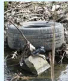
Illegal dumping in the creek

Help Euclid Creek Watershed partners keep an eye and ear on the creek by letting us know about new developments, active construction sites, illegal dumping activities, zoning and ordinance variances and other issues in your neck of the watershed that may lead to degraded water quality. Training and guidance provided.