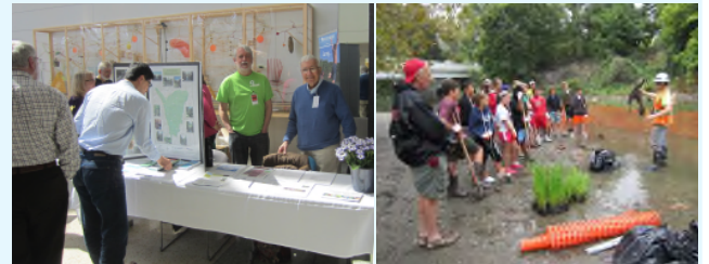
Euclid Creek Watershed Table at Community Event & Volunteer Wetland Planting

Help us spread the Euclid Creek awareness message at environmental and community events and festivals. Volunteers are needed to staff the Euclid Creek table at community events and to volunteer at cleanups and planting events. Assistance provided at first event.