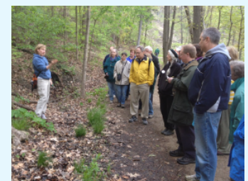
Friends of Euclid Creek monthly meetings include speakers, picnics and hikes

Attend one of Friends of Euclid Creek's meetings, tours or hikes or become a member to help build our organization (more information on back page). Provide input on projects and programs by serving on the Board or on one of our committees. 2016 is focused on our Membership and Board Development committees.