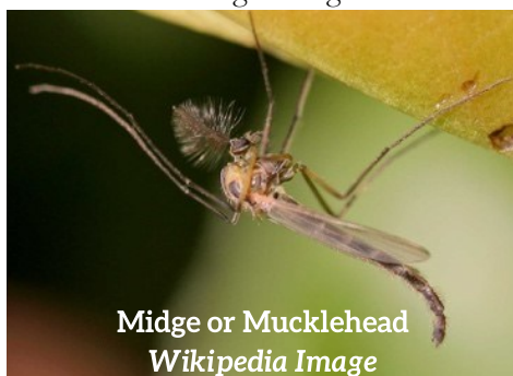
Midge or Mucklehead Wikipedia Image

So next time you swallow a bug, I invite you to change your tune to, “(cough, cough) I wonder if that was a clean water insect? I sure hope so.”