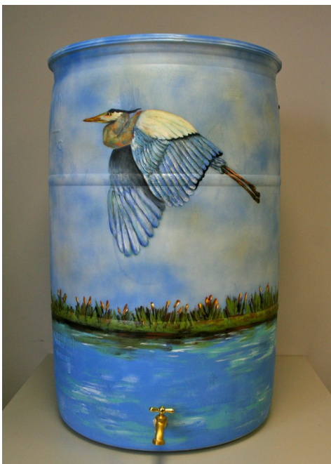
Majestic Blue on the Canal—2012

A Call for Artists has been made to identify twelve designs. The artists will be selected and commissioned to paint their designs on rain barrels; and, when completed, the barrels will be exhibited in the gallery space at the Beachwood Community Center. Commissioned artists will be given a 55 gallon rain barrel on which to complete their design, and paid $100 for their finished barrels. The barrels will be auctioned via a silent auction during the course of the art exhibit with the proceeds benefiting the