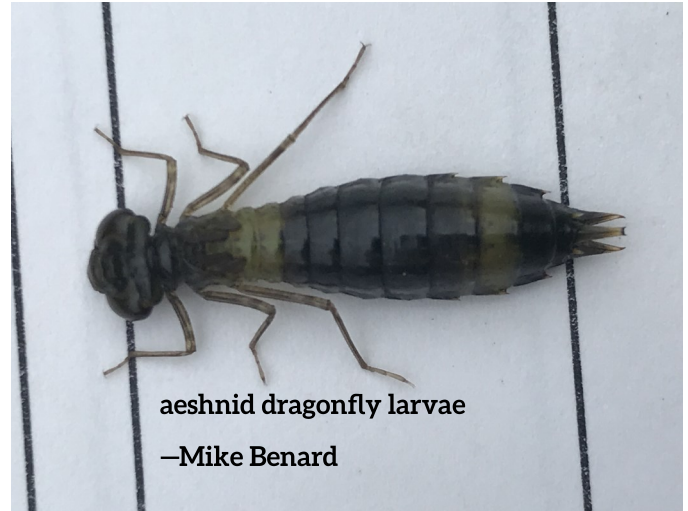
aeshnid dragonfly larvae

During the CWRU survey, newly-hatched green frogs from 2018 were found, as were 1-year old green frog tadpoles from 2017. The CWRU biologists also found a juvenile Bullfrog using one of the small wetlands. In addition to amphibians, dragonfly larvae and other insects were abundant in the new wetlands.