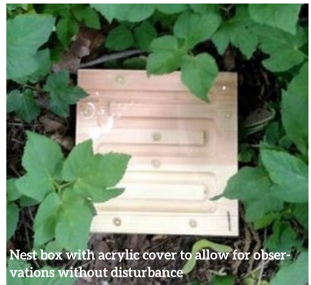
Nest box with acrylic cover to allow for observations without disturbance

In Fall 2017, researchers distributed ant nest boxes at Acacia Reservation. These nest boxes are easily accessible to CWRU students, researchers, and the general public and are already generating data, with 162 observations uploaded to iNaturalist . From these observations, the lab has been able to interact with citizen scientists to identify and confirm specimen photos, as well as answer questions about the research being conducted at the Acacia Reservation. In the coming year, they hope to distribute signage to mark the areas for the nest boxes that will include a QR code for visitors and researchers to easily upload images to the iNaturalist portal. Find out more on our Acacia Project Page of our website.