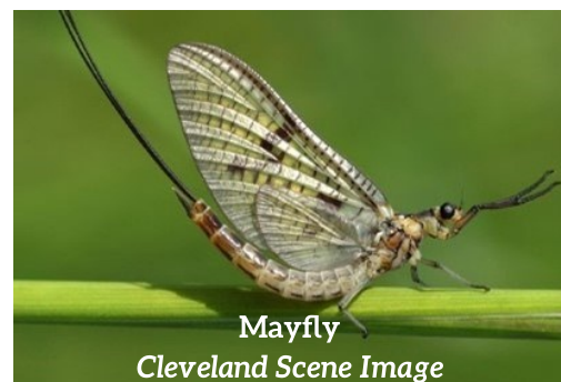
Mayfly Cleveland Scene Image