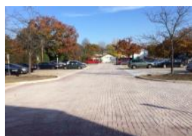
South Euclid rear parking lot before (far left) and after (near left) photos