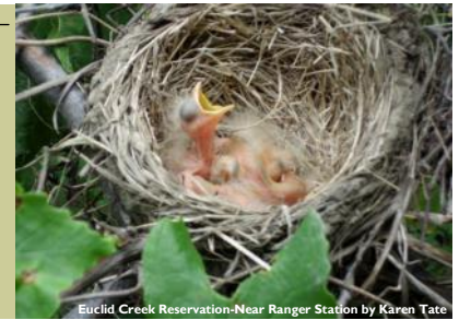
Euclid Creek Reservation-Near Ranger Station